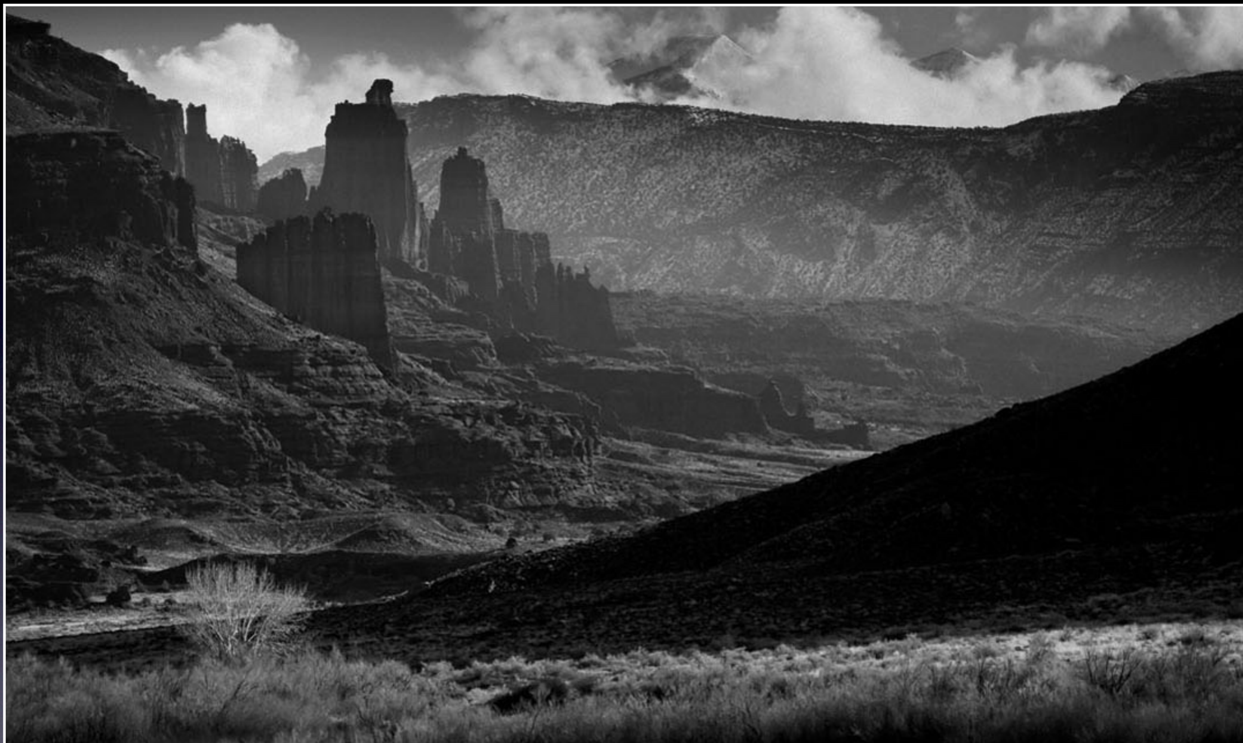
In February we were traveling on Rt. 128 in Utah on the road to Moab and Jan captured this shot of Fisher Towers.